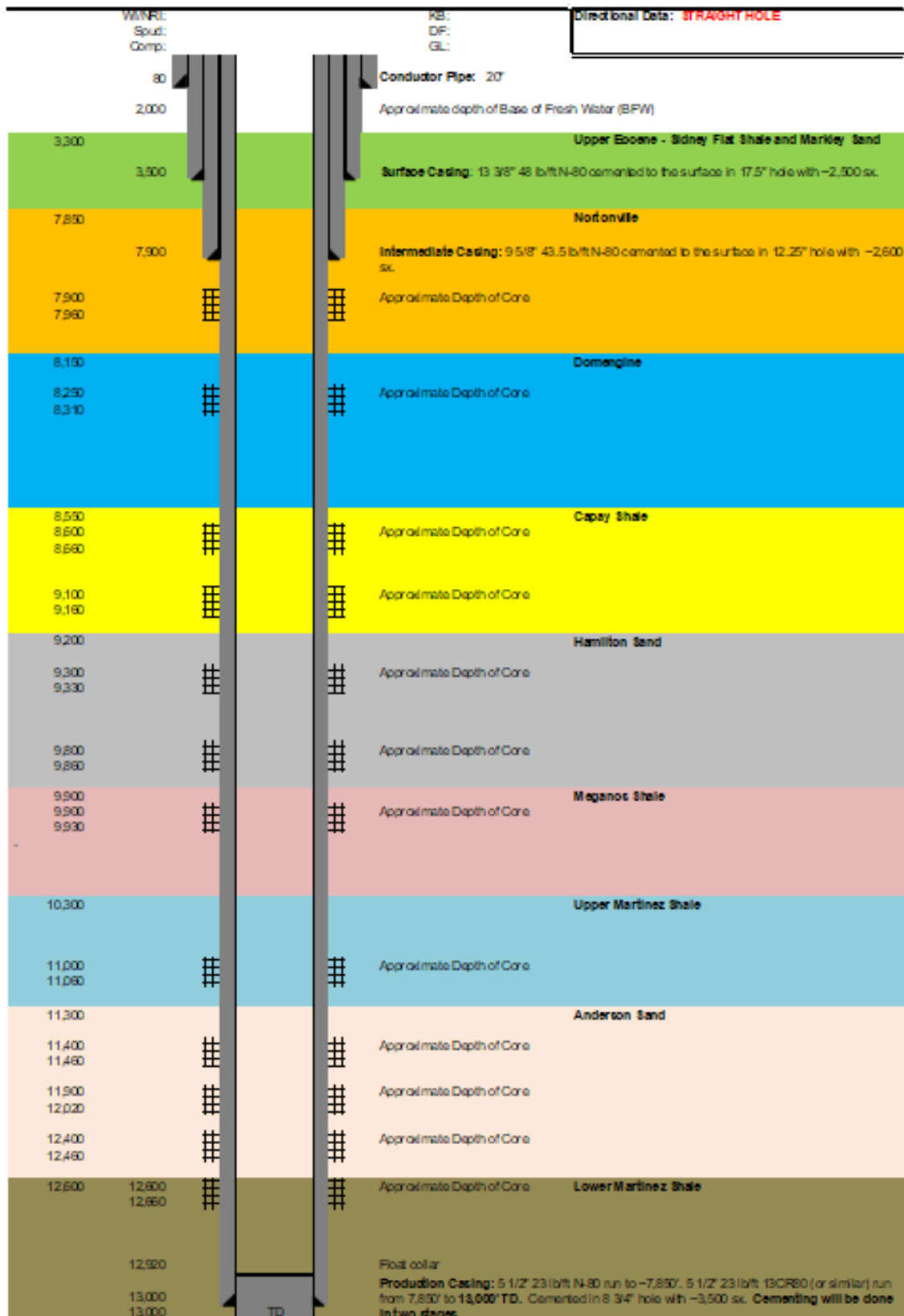
FIGURE A.II-3. DRAFT SCHEMATIC OF IZMW-A1