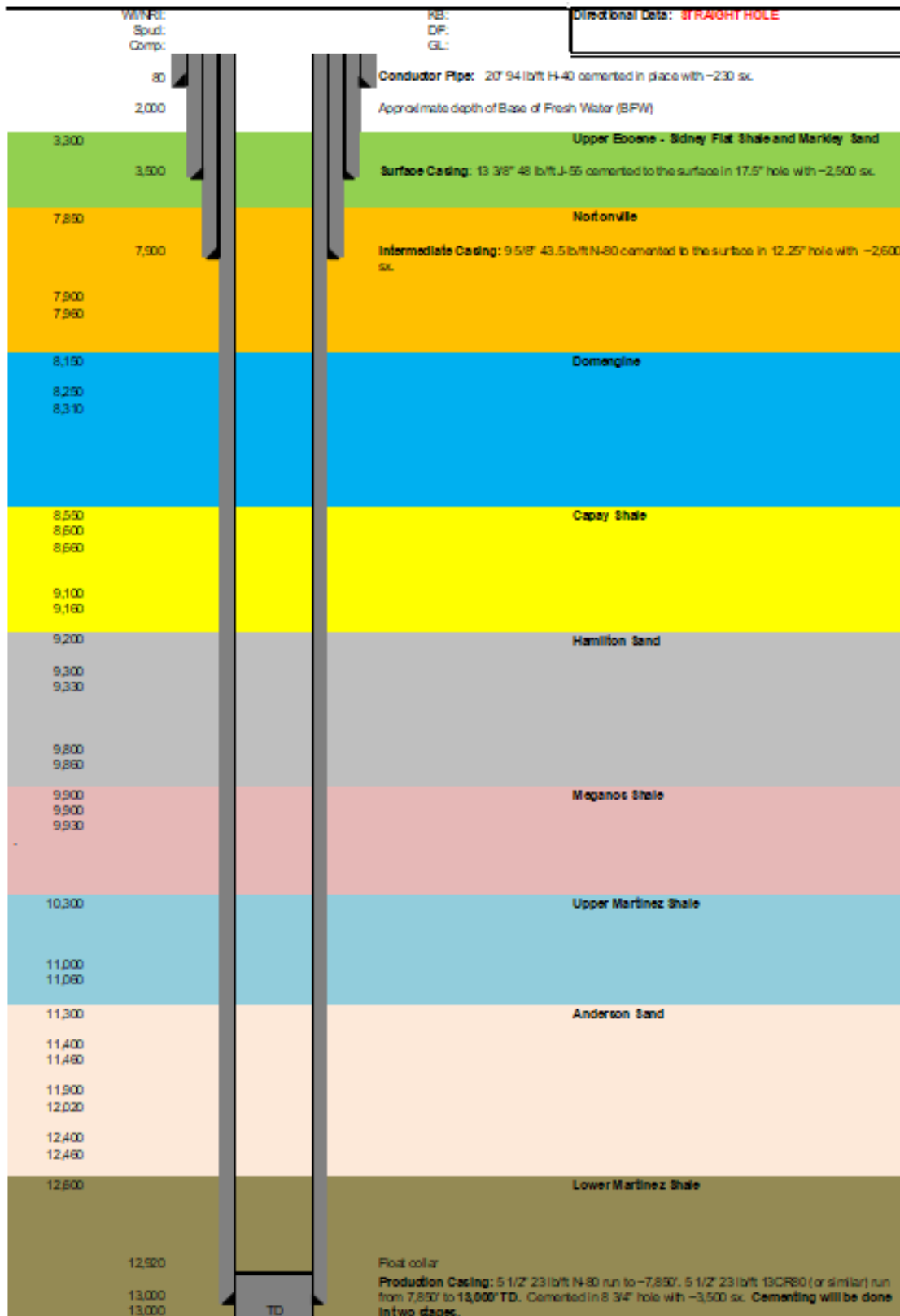
FIGURE A.II-1. SCHEMATIC OF IW-A1 IN INJECTION WELL SERVICE